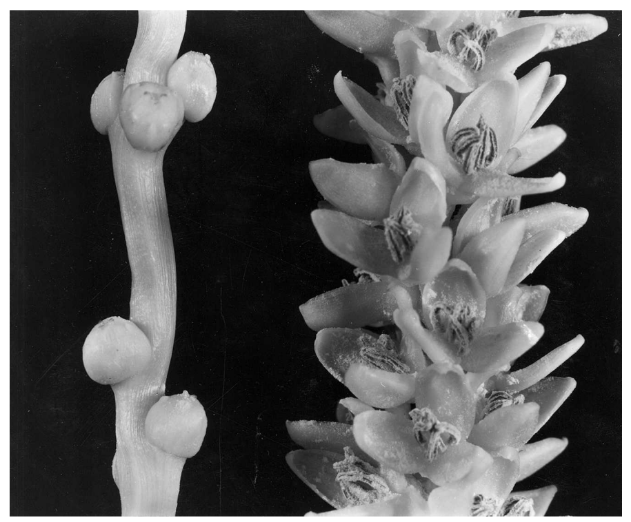
Fig. 2. Male (left) and female (right) flowers of date palm.

Dates flower when the shade temperature increases to more than 18 °C, and form fruit when it is more than 25 °C (Zaid and de Wet, 2002a). The flowers (and later the fruit on female trees) are borne on a flat, tapering peduncle or rachis, commonly known as the "fruit stalk" in the female trees. The inflorescence consists of many unbranched rachillae, known as "strands," arranged in spirals on the rachis. Both female and male flowers usually have three sepals and three petals (Fig. 2). Male flowers are usually waxy white and female flowers usually are yellowish green. Just before flowering, the inflorescence arises in the axis of the leaves, pushing through the sheaths, and the sheaths crack longitudinally at anthesis. Only the portion of the rachilla that bears flowers is exposed. Fifty to 60 d after anthesis, the fruit stalk elongates and pushes out the portion of the inflorescence that does not bear flowers to a length of 60 to 120 cm. The fruit normally develops after fertilization from one of the three carpels within each pistillate flower.