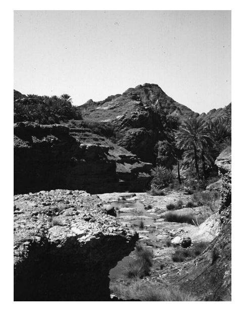
Fig. 1. The Khattwa Oasis in Oman is representative of the types of conditions in which date palms originated and are adapted. Traditional date palm cultivation is still practiced in such oases. (R.R. Krueger)

belonging to Palmaceae (Barrow, 1998). The name of date palm originates from its fruit; "phoenix" from the Greek means purple or red (fruit), and "dactylifera" refers to the finger-like appearance of the fruit bunch. Date palm is dioecious, meaning it has separate female and male trees. Throughout the years, there have been various reports of hermaphroditic trees developing, or male trees developing female characteristics (Sudhersan and Abo El-Nil, 1999). Inflorescences of female and male trees differ in morphology (Nixon and Carpenter, 1978; Swingle, 1904; Vandercook et al., 1980). Both are enclosed in a hard, fibrous cover (the spathe) that protects the flowers from heat and sunlight during the early stage of flower development.